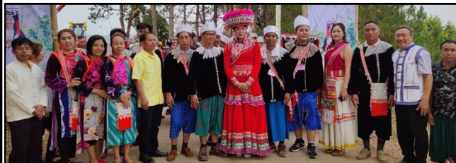
A fellowship meal gathering of Lisu Hill Tribe members - some from Thailand, some from Myanmar and some from China.