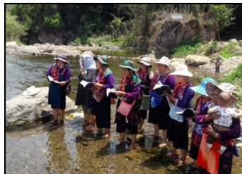
Christian Baptism of new Lisu believers in northern Thailand